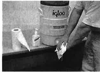
Dry with paper towels