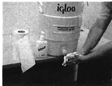
Wash for 20 seconds