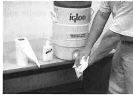
Dry with paper towels