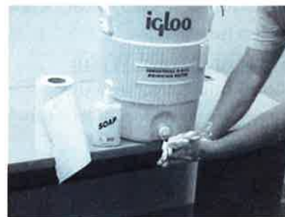
Wash for 20 seconds